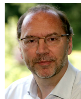
Flanders native, Dr Peter Piot, was Executive Director of UNAIDS from its creation in 1995 until the end of 2008.

Estimates show that around half of all sex workers in Eswatini, Lesotho, Malawi, South Africa and Zimbabwe are living with HIV. In South Africa, UNAIDS reviews and provides direct inputs into the National Sex Worker HIV Plan to ensure equal access to health and legal services for sex workers. UNAIDS also supports civil society AIDS responses with their target achievement, data collection and reporting, and linkages with other programmes and campaigns. Finally, UNAIDS works closely with sex worker organizations and supports their participation in national, regional and global consultations and fora.